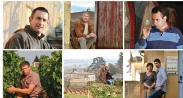
FAMILY OF WINEMAKERS

Each wine is the ultimate expression of the unique terroir and character of each estate and its vineyards.